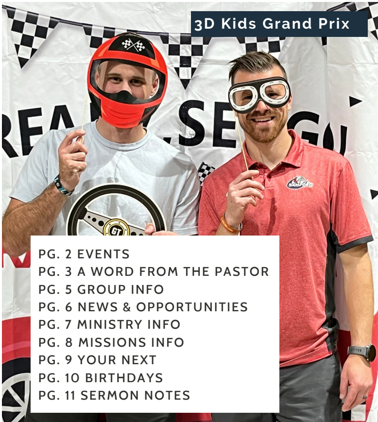
3D Kids Grand Prix