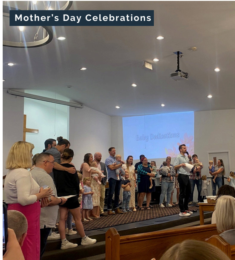
Mother's Day Celebrations