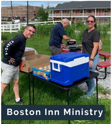
Boston Inn Ministry